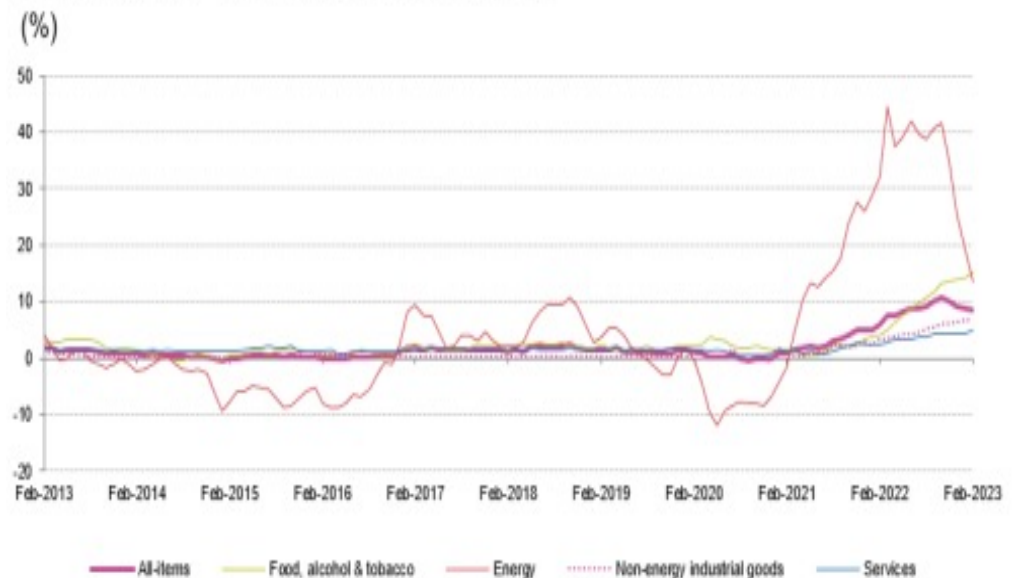
Euro area annual inflation and its main components, February 2013 - February 2023 (estimated)